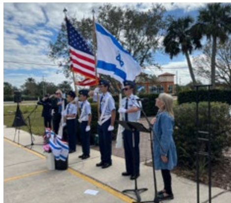
American Space Museum sponsored Astronaut Memorial event.