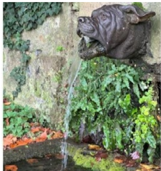
Devil Dog Fountain in BELLEAU WOOD, FR.

“Are you a member of the MILITARY ORDER OF THE DEVIL DOGS?”