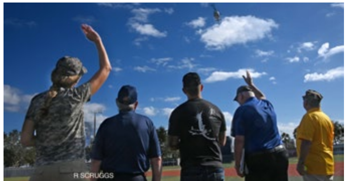
During the amazing Huey Flyover