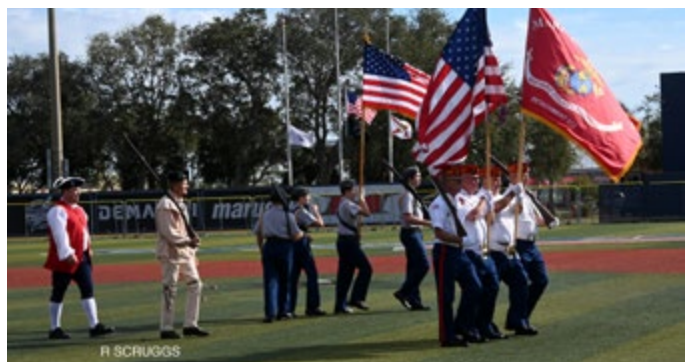
SAR, Marine Corps League and Viera HS JROTC Color Guards