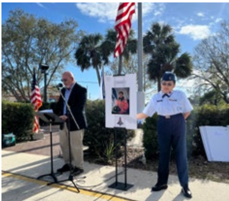
Israeli Astronaut, Ilan Ramon was honored.