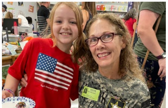
My granddaughter and I at breakfast