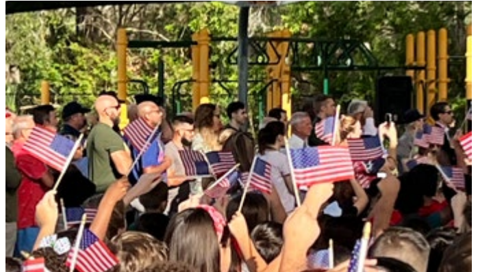
Deer Park Elementary in Tampa