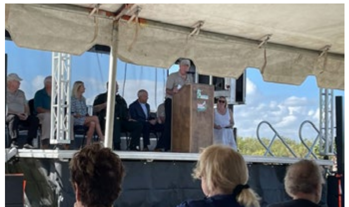
Amphitheater Groundbreaking Speakers