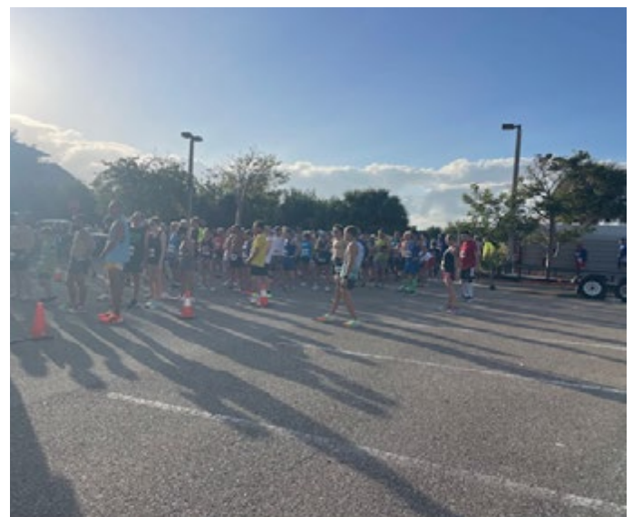
St. Francis Reflections Race Start at the VMC.