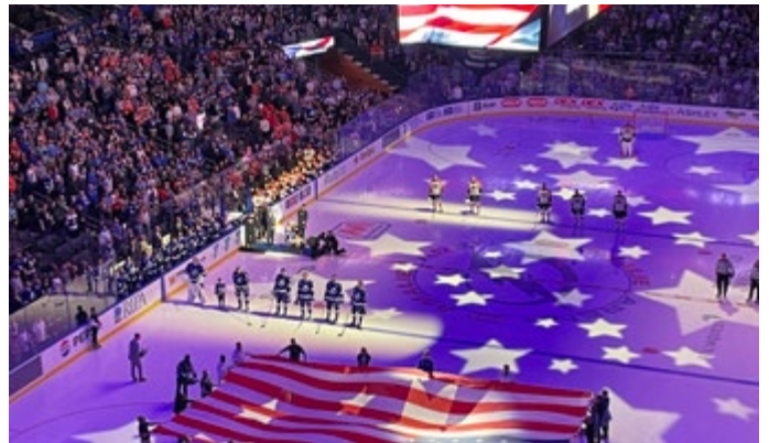
The Bolts celebrate Veterans