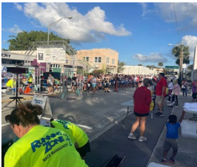
NVHS Race Start in Eau Gallie.

The NVHS 7th Annual Homestretch 5K was an incredible success, with 395 participants—including 86 veterans, 16 teams, and 16 sponsors! The energy, compassion, and unity made it a powerful day, showing how much we can achieve together.