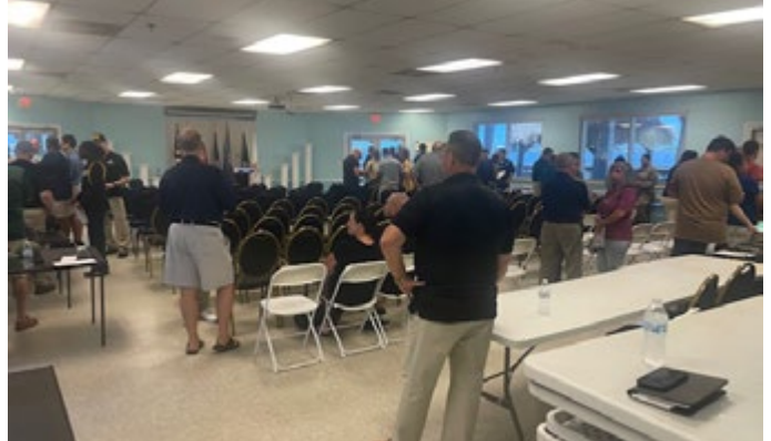
Students and Parents talk with all the presenters (1)

While the student numbers were down this year (perhaps due to rain threats, soccer tournaments, SAT testing, etc.), enthusiasm and appreciation was not. Good luck to those students as they negotiate their educational paths and consider some fantastic military options.