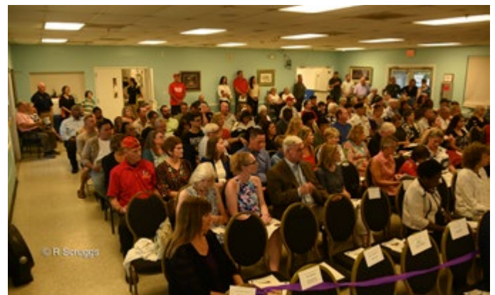
A dedicated crowd was present to honor the Purple Heart Recipients