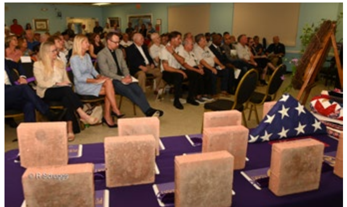
Remembrance bricks, which will be placed in the VMC Memorial Plaza