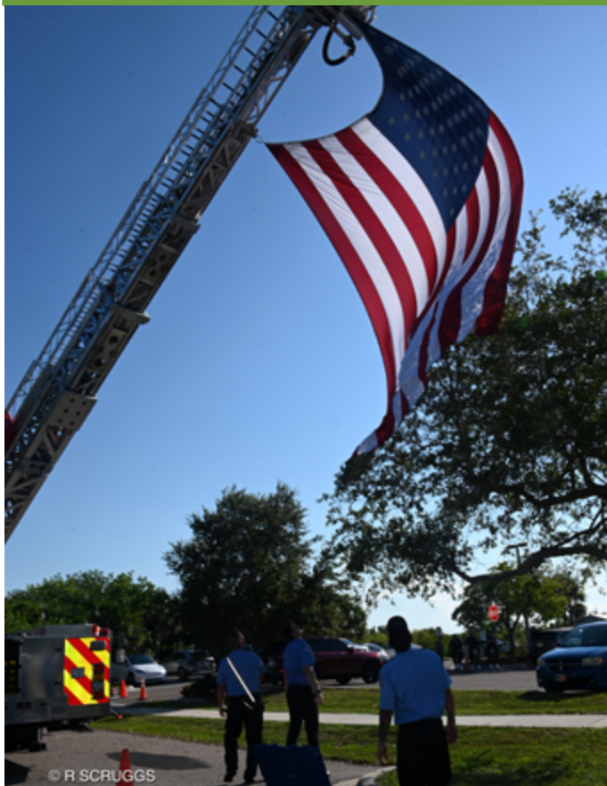
Pictured: The American flag hangs proudly during the 9/11 remembrance ceremonies.