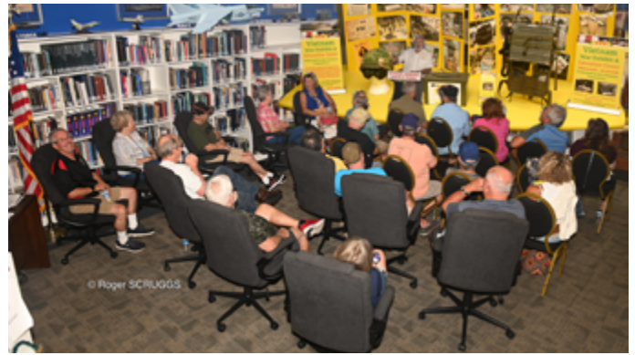
Pictured: Library Discussion Meeting on 26 September. Hope to see you on October 24 for a continuation of the Vietnam topic

The Museum is dedicated to preserving the Vietnam