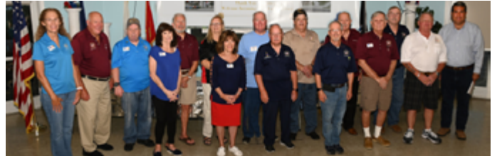
Pictured: The newly elected Board and Committee heads at the swearing-in in July.

I want to make sure that we work as a team and to get that I out of everything. Nobody runs that place by themselves. It takes everyone working together to make it work.