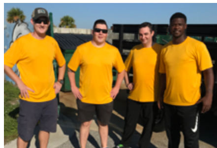
Pictured: Newly selected Chief Petty Officers (E-7) who will be initiated and pinned in the near future, following a time honored Navy Tradition

Naval Ordnance Test Unit (NOTU) Chiefs held a work party at the VMC on September 23rd. This has turned out to be an annual occurrence with NOTU and is greatly appreciated. The four in yellow shirts are newly selected Chief Petty Officers (E-7) who will be initiated and "pinned" in the near future, following a time-honored Navy tradition.