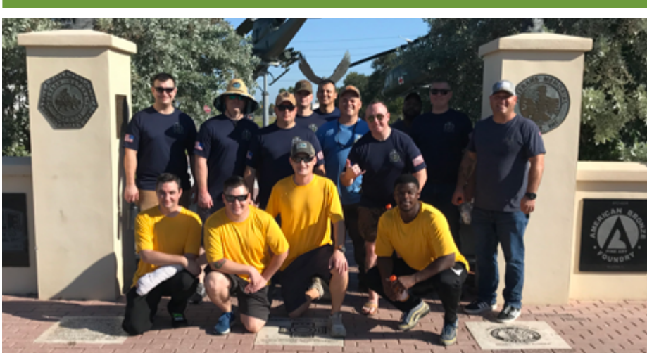
Pictured: Naval Ordnance Test Unit team members

to our 9/11 Ceremony. Since our great photographer was there for the earlier event, we finally have the record of their passion.