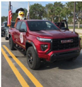
Pictured left: Freedom the Eagle truck