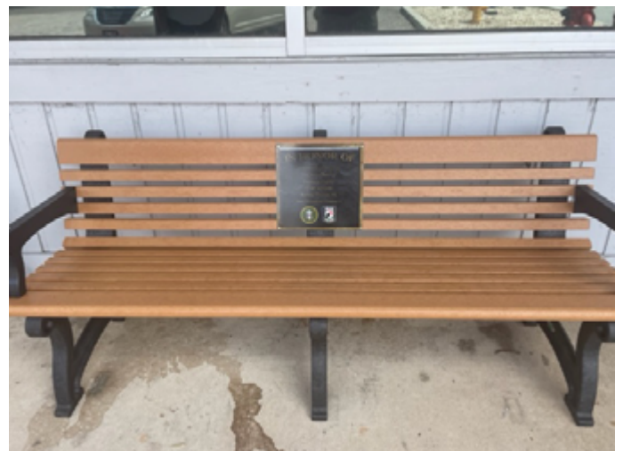
Pictured: The JJ Justice (RTFL/1) memorial bench