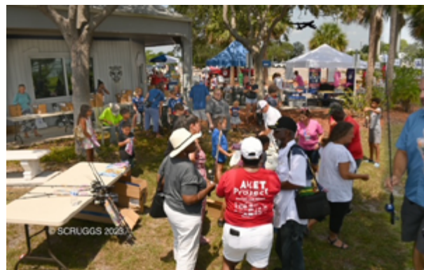
Pictured: AVET fed over 200 back at the VMC.