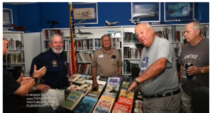
Pictured: Participants at the Library Discussion Series about Civil War Naval Battles

from a tactical and commerce perspective. Amphibious operations, submarines and torpedos were all employed during the war much to the surprise of the audience.