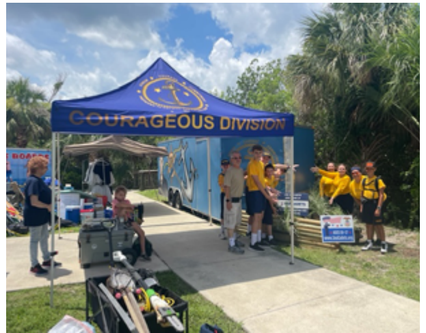
Pictured: Sea Cadets at work improving their trailer and the VMC area.

America has always defended on its youth to one day lead our country and MOAACC/GDF and VMC are very pleased to have that mission as a top priority.