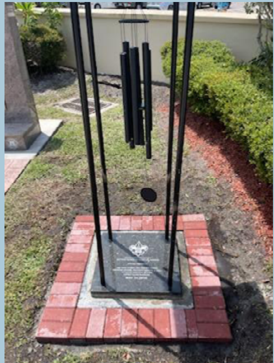
Paver upgrade and cement barrier to protect Eagle Scout Project Chimes in the VMC Memorial Plaza. This beautiful project was nearly destroyed by a very intoxicated driver several months ago. Thanks to CSpray for a great restoration with a brand-new, much improved base with pavers and replacement wind chimes.