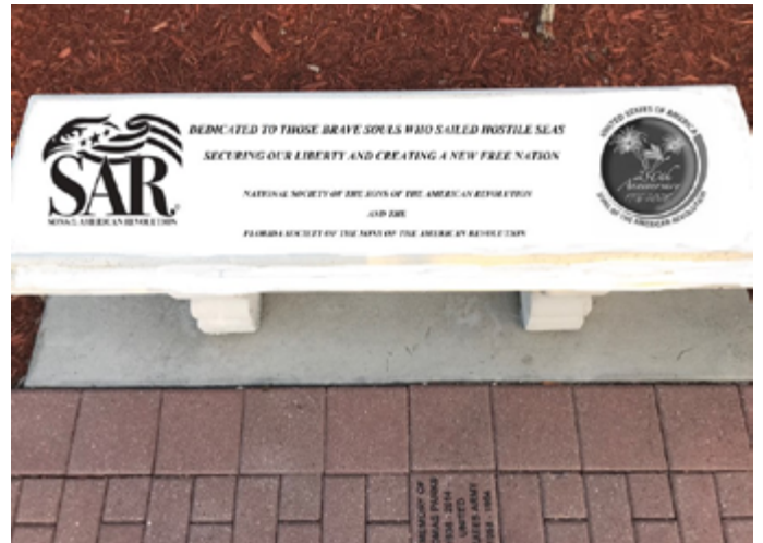
Pictured: The Sons of the American Revolution (SAR) bench will be dedicated mid-July by the SAR National President.