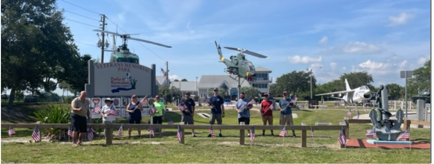
Pictured: United Launch Alliance Phase II donated and installed over 500 flags to decorate the VMC and Plaza like never before for the big Parade and VMC Party after Independence Day.