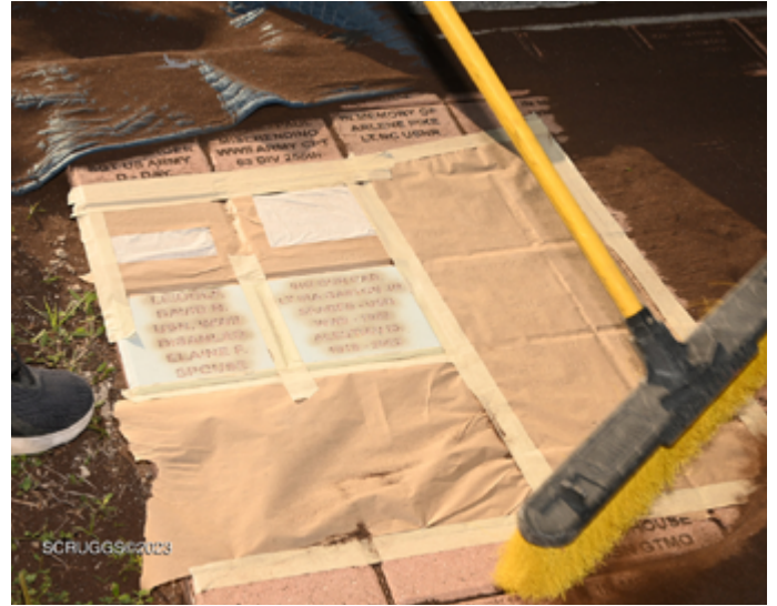
Pictured: 30 new bricks were added to the Plaza in June 2023.