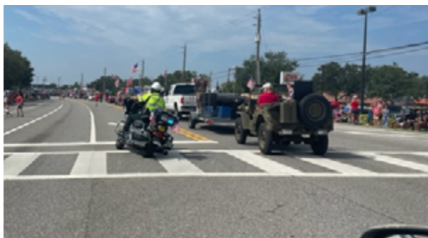
Pictured: Parade Underway — Note mini Sub and WWII Jeep in front of MOAACC entry