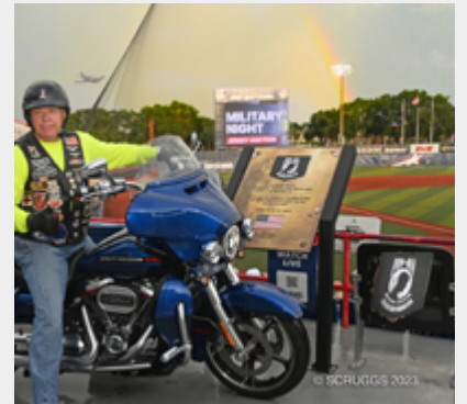
Pictured: POW/MIA bench before the storm.