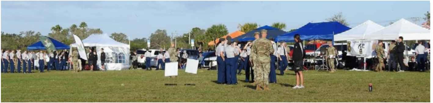
Pictured: A recent JROTC drill meet at the VMC Park