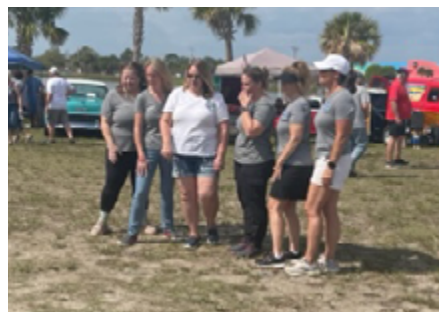
Pictured: The Leaders of Back Brevard Heroes at the Car Show fundraiser