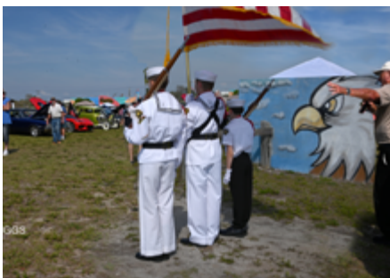
Pictured: Sea Cadet Color Guard opens the show!

BBH is a Local non profit organization "dedicated to supporting and appreciating our local first responders, our heroes, with an annual BBQ and other events." Those they want to show that they are loved and appreciated include those who server in local Law Enforcement, Firefighters, EMT, and Military members. In May, BBH will hold their annual recognition event at the VMC to honor and feed all local first responders, military and veterans at their Annual Back Brevard Heroes Celebration. Read more about the organizaition on their website .