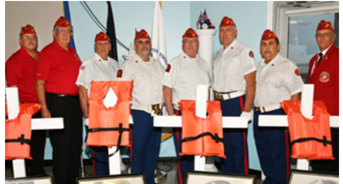
Pictured: Immortal Four Chaplains Ceremony.

Ruled ineligible for the Medal of Honor due to rules about direct combat, the Four Immortal Chaplains received many awards including the Purple Heart. Decades later Congress