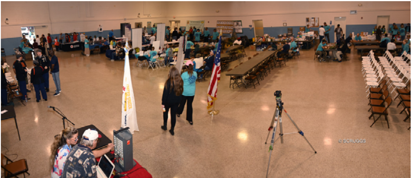
Pictured: Ready to start the event!