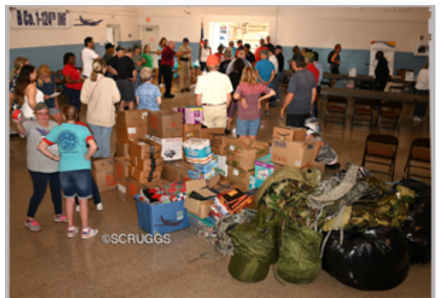
Pictured above: Preparations on Friday, January 20th.