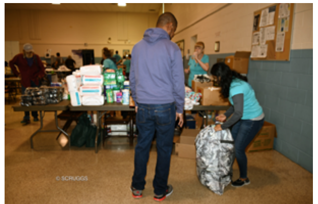
Pictured: Escort literally carries the load in support of a veteran in need.

Thanks to all who supported the Central Brevard VMC 2023 SDSU in so many ways. The veterans who came got first class support and knew that in Brevard, "No One is Left Behind".