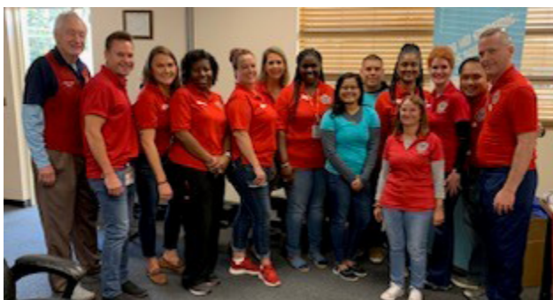
Pictured left: Great contingent from VA Orlando and the local VA handled check in, benefits and several medical points.