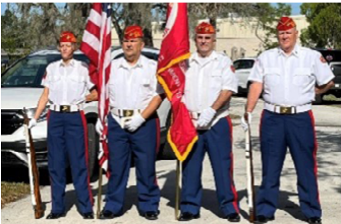
Pictured: Brevard County Marine Corps League Honor Guard