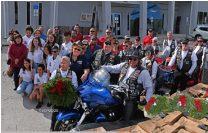
Pictured: Escort preparing to leave Veterans Memorial Center to escort wreaths to Pinecrest Cemetery