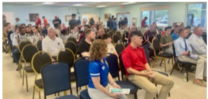
Caption: High school students attend the first seminar to educate students on the paths to military academies and ROTC scholarships for college.