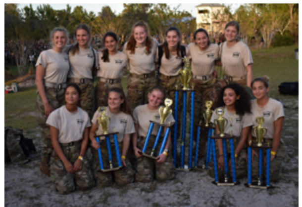
Pictured: Congratulations to the Lady Rader Challenge Team!