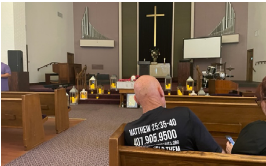
Pictured: Candles were lit for each homeless person who died this year on the streets.