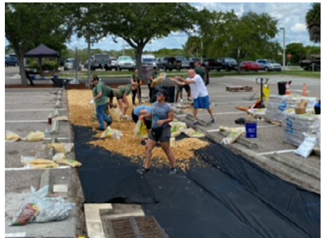
Pictured Top : Cement in the process of being laid for the Allies Monument