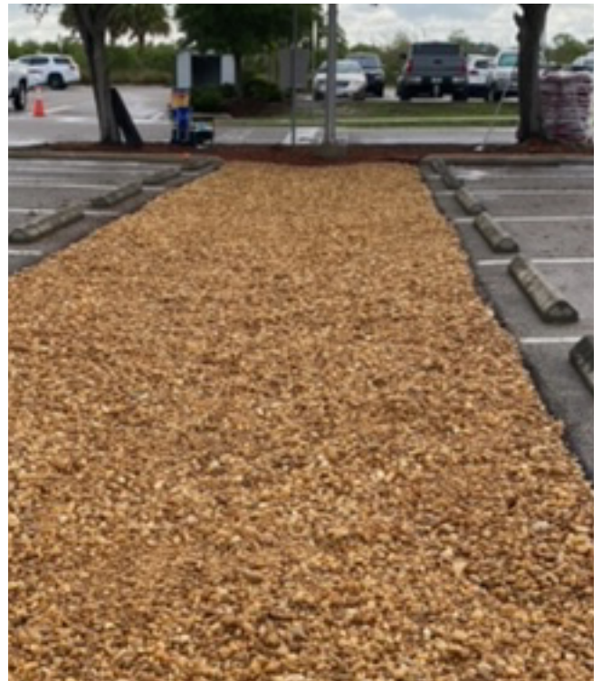
Pictured Bottom: The parking lot before and after the renovations by the Elevation Church volunteers.