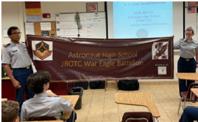
Pictured: Just after the meet, Astronaut JROTC cadets hold up a new banner provided by GDF to help identify their team during future meets. GDF hopes to so offer banners to all JROTC Units in Brevard before the 2022-23 school year begins with a new round of active competition.