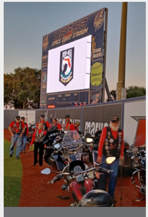
Pictured: RTFL-1 assembled at Space Coast Stadium.