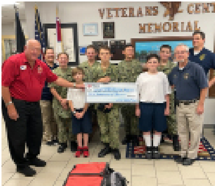
Caption: All the Sea Cadets share the moment.