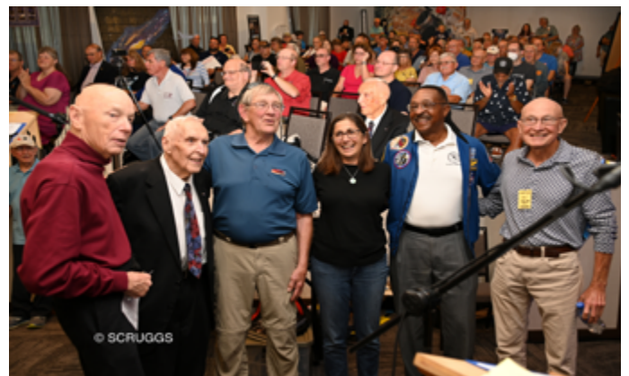
Pictured: Memories and Pride together: Some of the guests and participants in the Space Shuttle Program. Can you spot the astronauts?