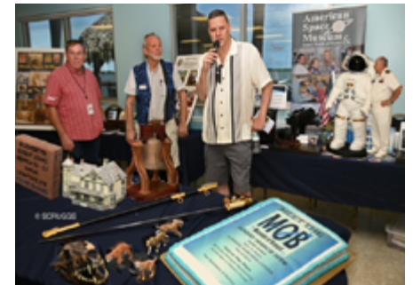
Caption: MOB meetings are informative for all in attendance. Improving the quality of our museums and educating the public is the ultimate goal.

Find the MOB's colorful brochure available at all MOB venues, Chambers of Commerce, and visitor centers.