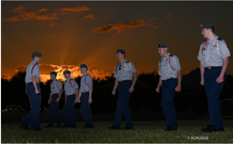
Pictured: The JROTC Cadre of Brevard ready to go in the Regional Drill Meet at VMP