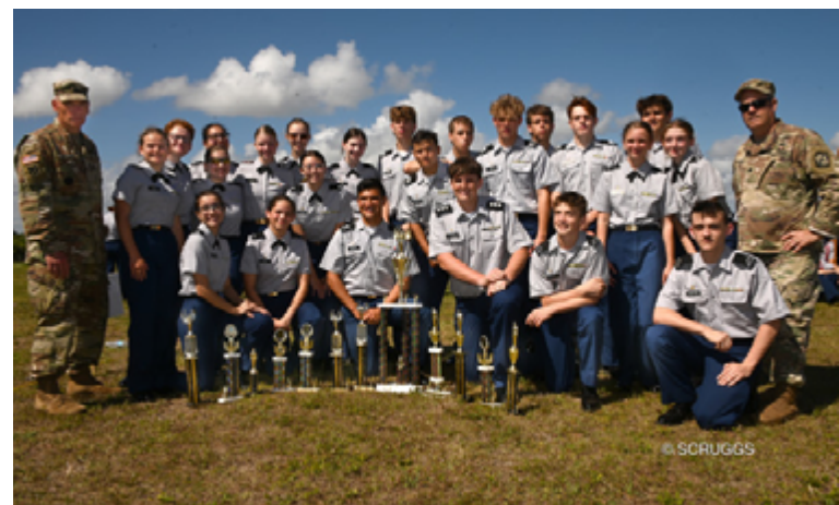
Pictured: The winning Cocoa Beach Jr/Sr HS JROTC Drill Team at Regionals.

The VMC supports these events. The Good Deeds Foundation (GDF) of the Cape Canaveral Chapter of the Military Officers Association (MOAACC) provides trophies, and American Legion Post 344 of Merritt Island covers the medals for the Sprint Relay Event. For veterans, there are few things more important than supporting our next generation.