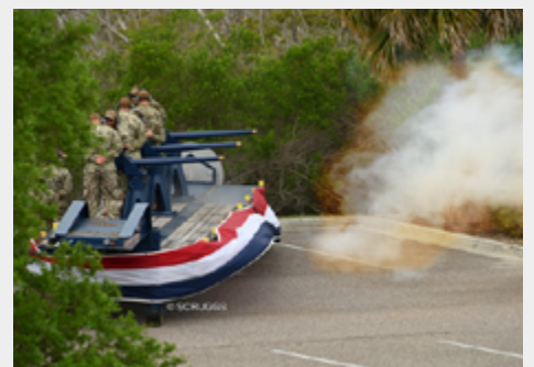
Pictured: A Parade of Flags, period costumes, and a 21 gun salute by NOTU were among the memorable sites at the event.