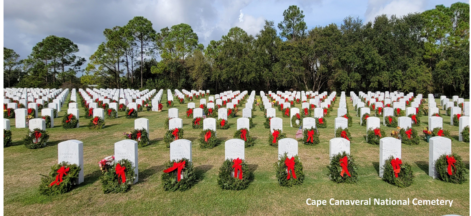
Cape Canaveral National Cemetery