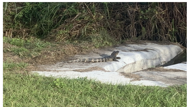
Newest addition to our ponds sighted on 12/18/21 Baby is approximately 24 " Long

Next month we should be able to share the VMP site map of all the projects once approved by next month, we should be able to share the VMP site map of all the projects once approved by County engineering. Our VMP will be unique in the State and most states when these projects are completed. County engineering. Our VMP will be unique in the State and most states when these projects are completed.